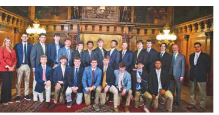
It was honor to host the Devon Preparatory School Basketball team in the Capitol in June. The team won the Boys Basketball State Championship!