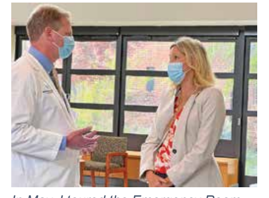
In May, I toured the Emergency Room at Paoli Hospital. Paoli Hospital is critical to our community, and I look forward to ensuring it receives the support it needs to keep our families healthy and safe.