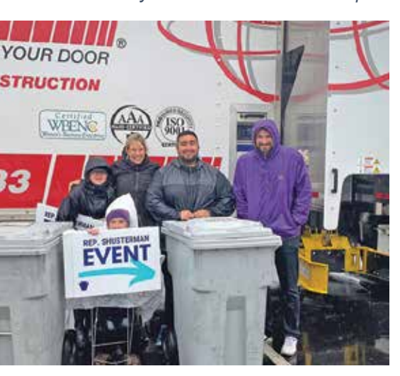
Thank you to everyone who came out for my shredding event in Phoenixville on May 7. Over 100 constituents drove by to have their documents destroyed. Neither torrential rain, nor sleet, nor freezing cold kept my office from working for you!