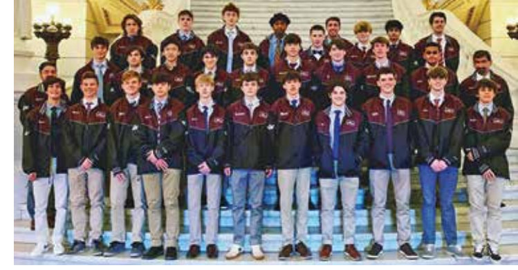
The Conestoga Boys Soccer Team also had an incredible season! The team was undefeated and the 2021 state champions.